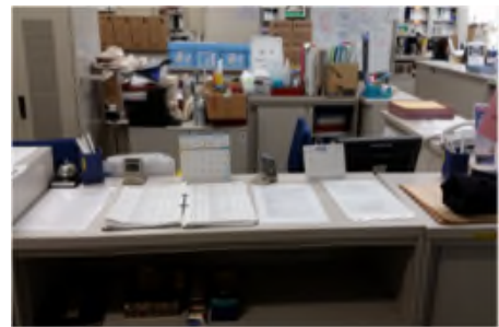
Counter of the Office of Property, 1F, Building 2