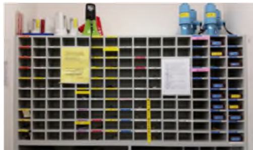
Key- locker of the Office of Property, 1F, Building 2