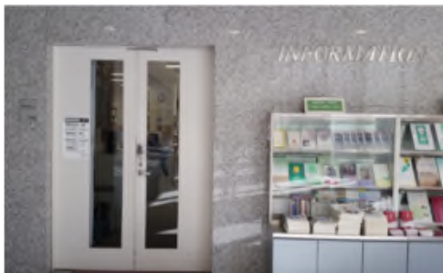
Entrance of the Office of Property, 1F, Building 2

*Regarding rooms on Mejiro Seibo Campus, please consult with staff in Room 202, 2F, Building 1, Mejiro Seibo Campus.