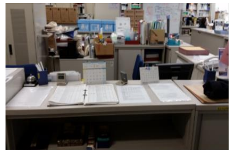
Counter of the Office of Property, 1F, Building 2