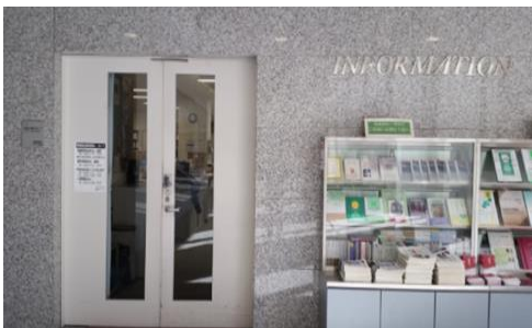
Entrance of the Office of Property, 1F, Building 2

*Regarding rooms on Mejiro Seibo Campus, please consult with staff in Room 202, 2F, Building 1, Mejiro Seibo Campus.