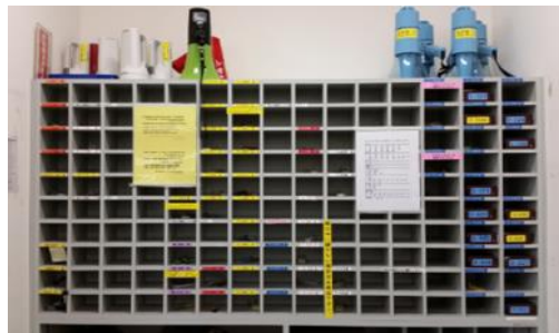
Key- locker of the Office of Property, 1F, Building 2